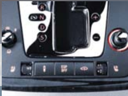
Seat heating and ESP